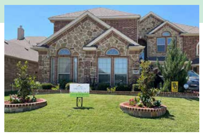
La Tierra ~ 2847 Pino