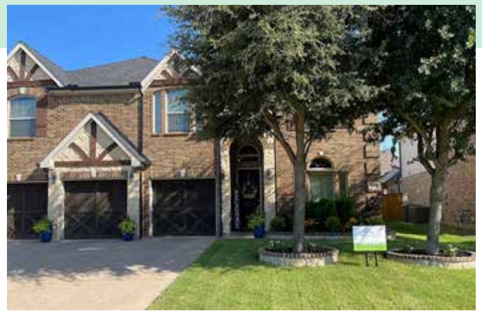
El Llano ~ 2927 Montalbo