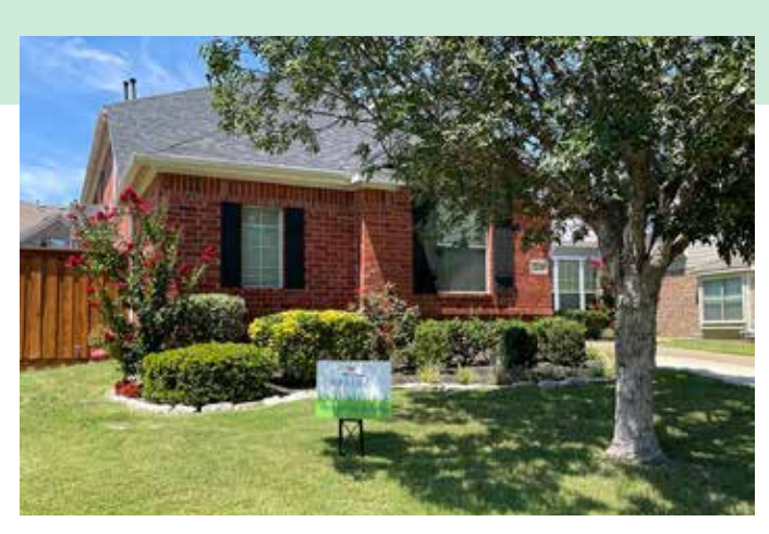
La Pradera ~ 7239 Tolosa

The Landscape Committee will choose monthly winners again, beginning in spring 2024. Homeowners whose accounts are free of violations and are properly mowed, edged, and completely weed free will be considered.