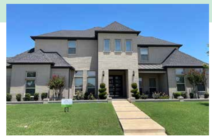
La Jolla ~ 7160 Playa Norte Dr

Congratulations to our neighbors at the following addresses for winning Yard of the Month for August 2023! Each winning homeowner has been recognized with a Yard of The Month sign in their yard. Winners also received a gift card!