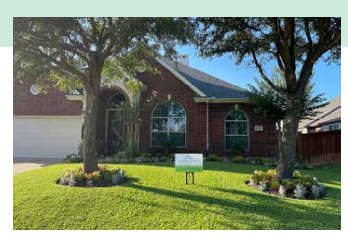
Marbella ~ 2752 Fuente