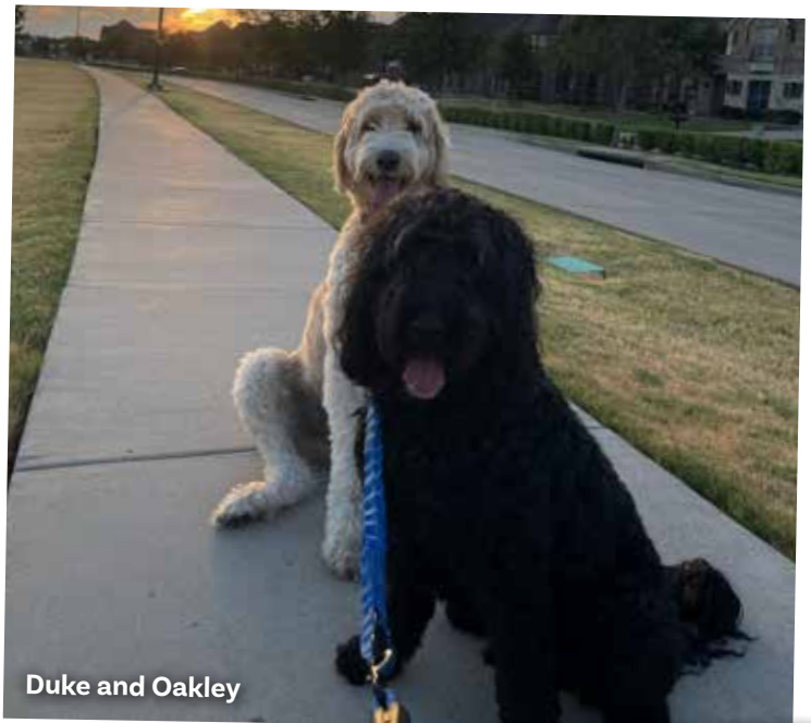
Duke and Oakley

Capture the moment then email communications@miralagoshoa.com . Include the photographer's full name and address along with a photo caption and a description of the location featured in the photo.