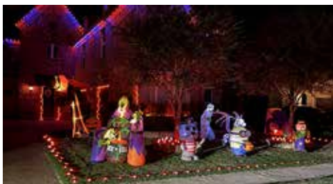
2811 Terrosa Dr.