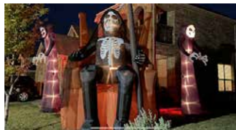
7303 La Mancha