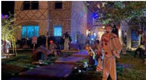
2823 England Parkway