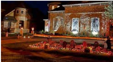
3051 England Pkwy