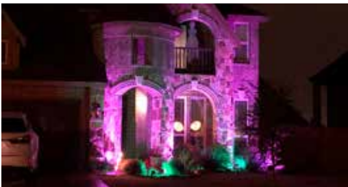
7223 BRISA DR