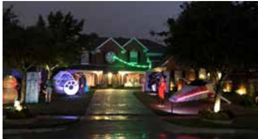
3028 S CAMINO LAGOS