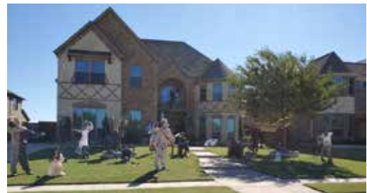
2823 ENGLAND PKWY

Mira Lagos was spooky this year! Thank you to everyone who entered the 9th Annual Mira Lagos Halloween Decorating Contest. Homeowners throughout our neighborhood decorated their homes this year despite heavy rain, strong winds, and low temperatures the week of Halloween.