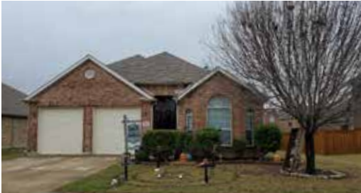
2872 S SERRANO