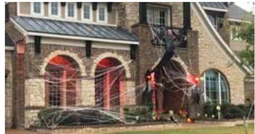
2936 ENGLAND PKWY