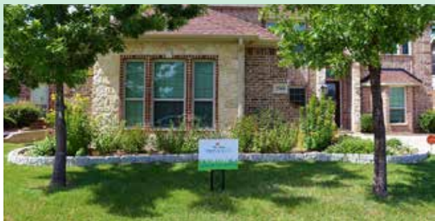
El Llano ~ 2960 Mirado

Congratulations to our neighbors at the following addresses for winning Yard of the Month for August! Each winning homeowner has been recognized with a Yard of The Month sign in their yard. Winners will also receive a gift card.