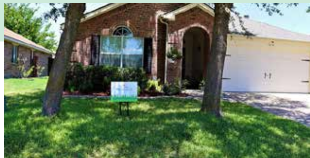
El Arroyo ~ 3216 Torio