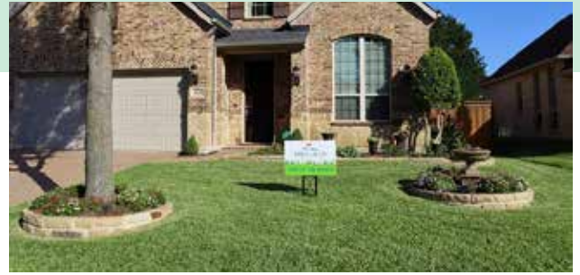
Cordova ~ 3035 Nadar