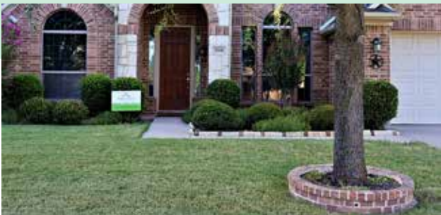
La Ensenada ~ 2940 Bandera