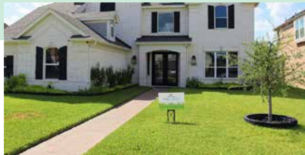
Las Brisas - Gated ~ 2712 Neblina Ct.