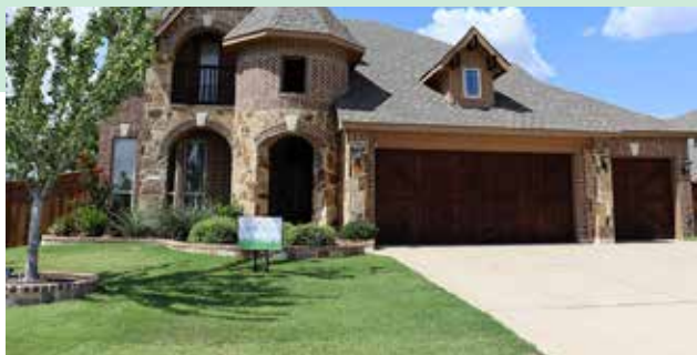
La Brisas ~ 7359 Vienta Pt.