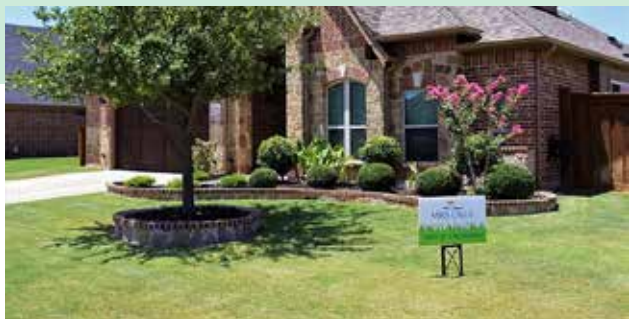
La Pradera ~ 7251 Portillo