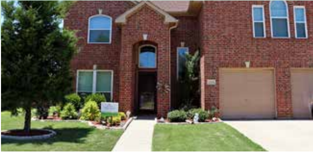
Valencia ~ 7359 Estela