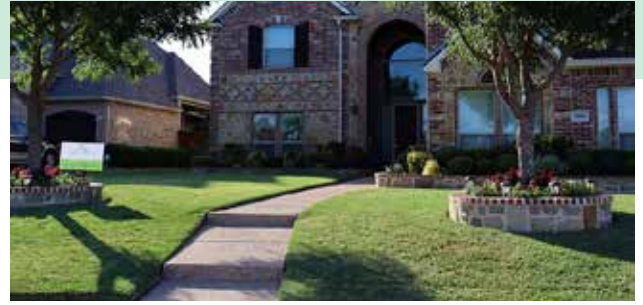
Bella Vista ~ 3008 England Pkwy