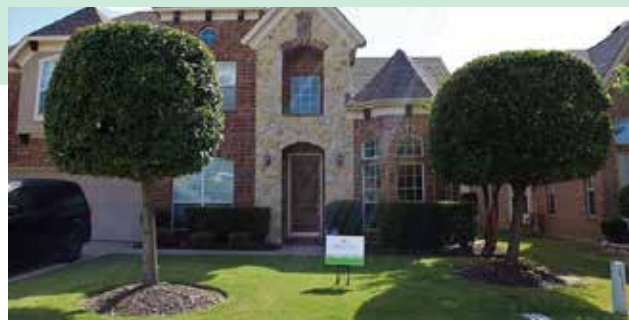
Marbella ~ 7227 Bucanero