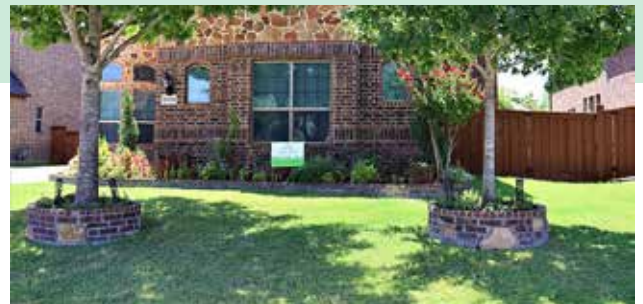
Escondido ~ 2951 Lavanda