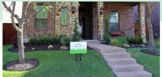
Sonora ~ 2921 Fontana