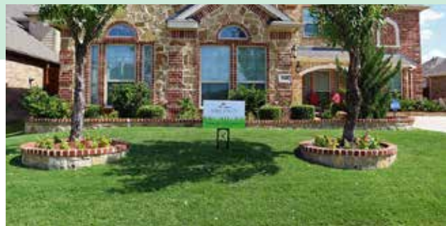
La Tierra ~ 2847 Pino