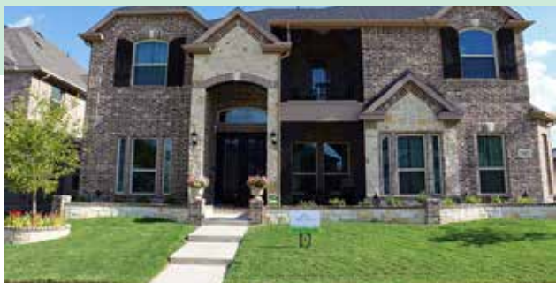
La Jolla ~ 2707 Corona Dr.