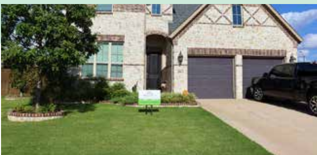
El Mirador ~ 2803 Mastil

Kudos to each neighbor who strived for a well-maintained lot during this summer of extreme, 100+ heat, and drought. The volunteer members of the Landscape Committee will choose more exceptionally maintained properties to win Yard of the Month next spring, May through August.