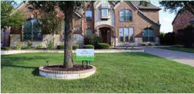
Bella Vista ~ 3211 England Pkwy