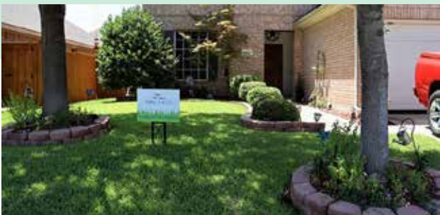
El Sendero ~ 2855 Tranquilo