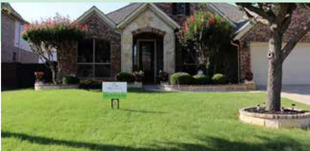
La Ensenada ~ 2912 Barco