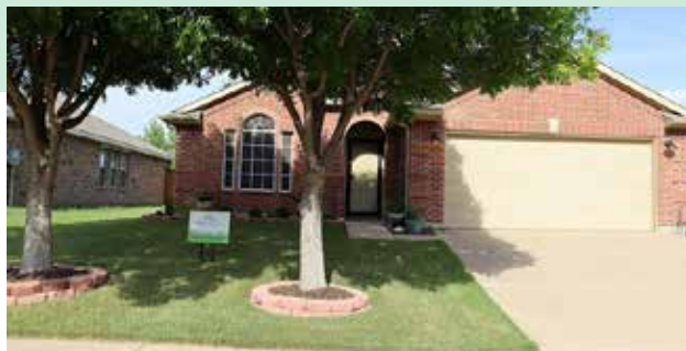
El Arroyo ~ 7460 Tormes