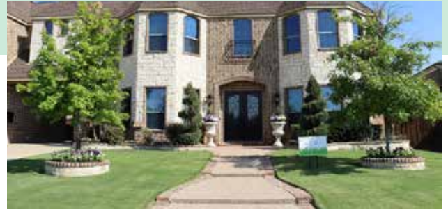
Bella Vista ~ 2959 England Pkwy