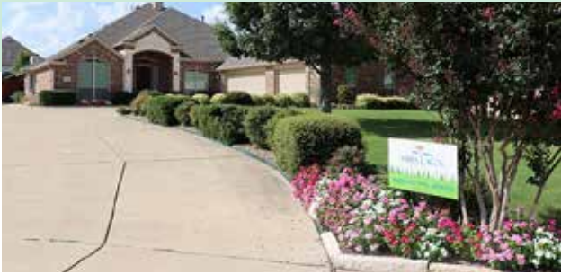
Bella Vista ~ 3004 England Pkwy