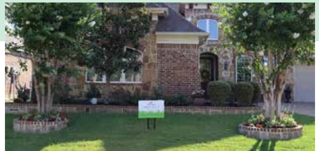
Escondido ~ 7067 Miramar