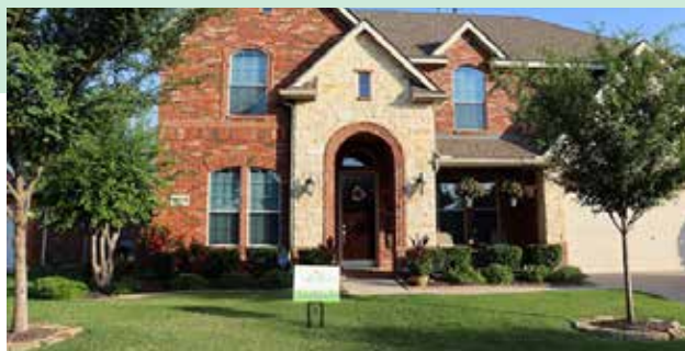
Marbella ~ 2759 Fuente