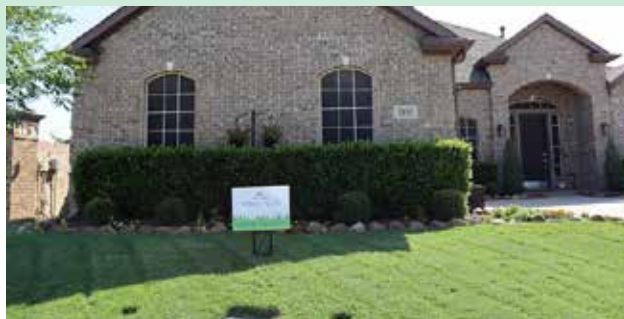
La Tierra ~ 7271 Roble