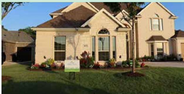
La Jolla ~ 2655 Corona Dr.