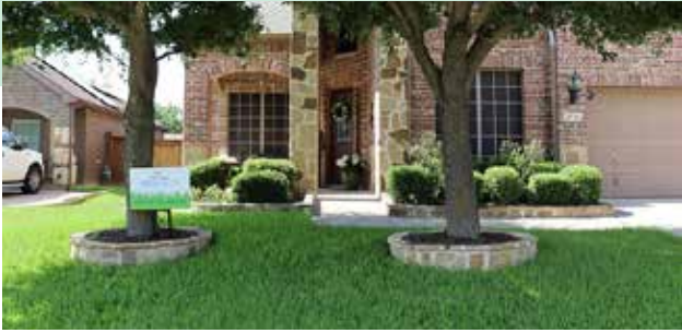
Valencia ~ 2716 Ponce de Leon