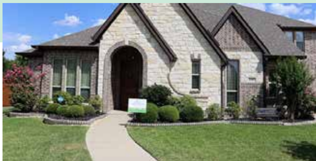
Las Brisas - Gated ~ 2707 Neblina Ct.