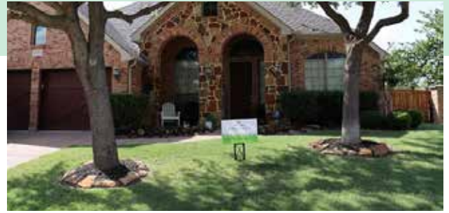
Cordova ~ 3004 Nadar