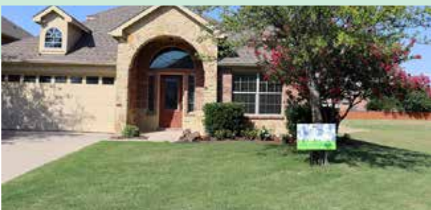
El Sendero ~ 6972 Alcalá