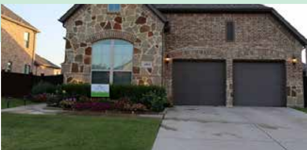
El Mirador ~ 6852 Ensenada

The Landscape Committee will choose monthly winners through August. If you would like your lot to be considered, make sure your property is mowed, edged, and weed free ( including your flower beds ) and that your homeowner account is free of violations.