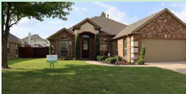
El Llano ~ 2940 La Roda

Congratulations to our neighbors at the following addresses for winning Yard of the Month for July! Each winning homeowner has been recognized with a Yard of The Month sign in their yard. Winners will also receive a gift card.