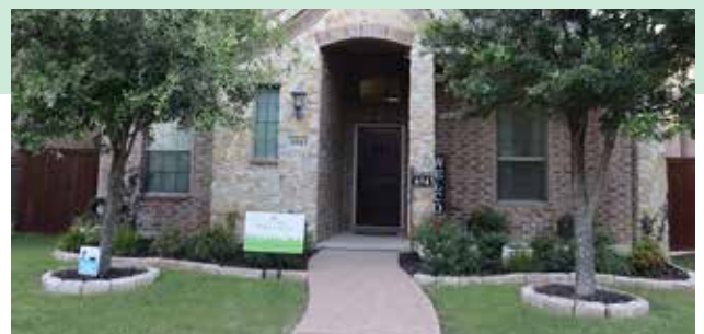
Sonora ~ 6943 Sarria