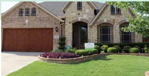
La Pradera ~ 3204 Meseta