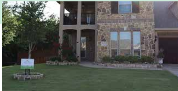
Las Brisas ~ 7419 Onda Ct.