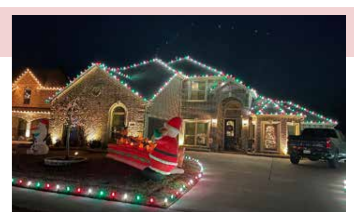
2651 CORONA DR