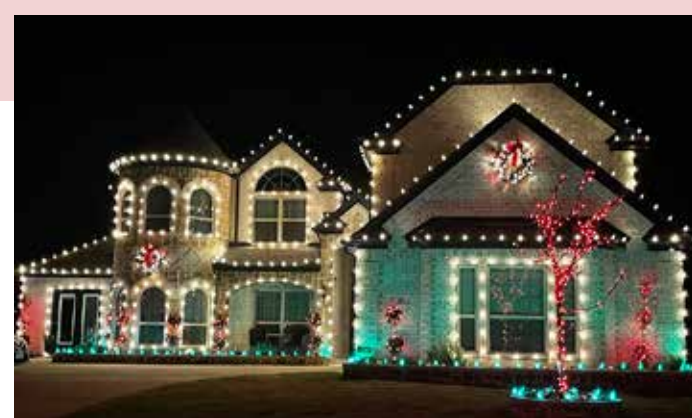
2911 ENGLAND PKWY