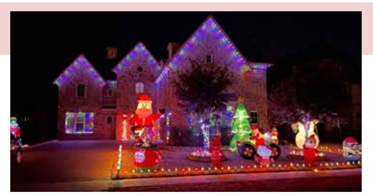
2811 TERROSA DR