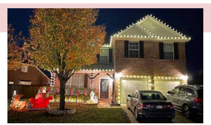
7016 N SERRANO