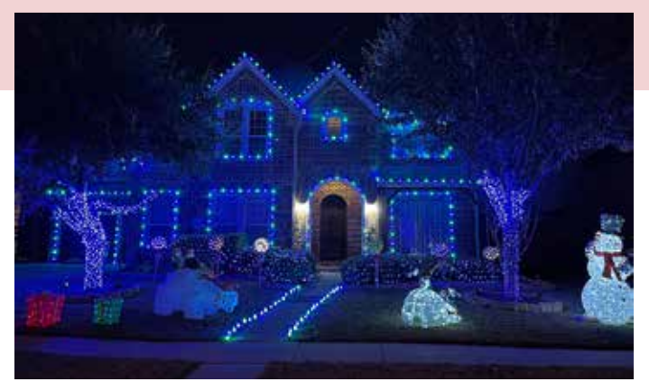
3052 ENGLAND PKWY