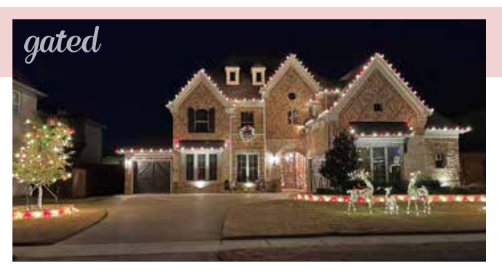
2715 NEBLINA CT