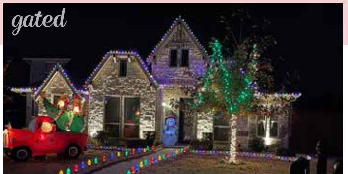
2743 NEBLINA CT