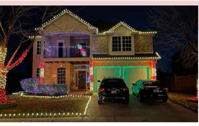
7027 N SERRANO